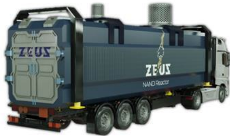
Renderings of proposed "Zeus" Microreactor