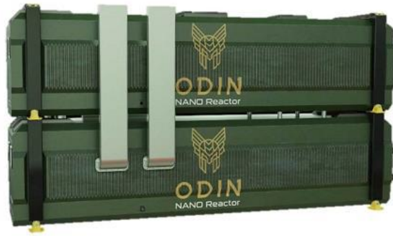
Renderings of proposed "Odin" Microreactor