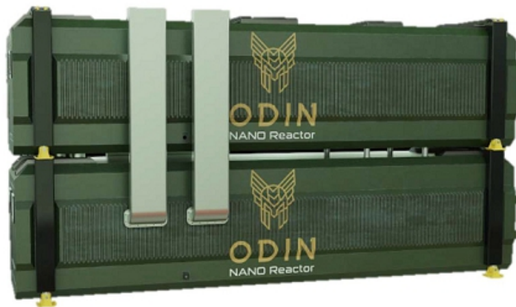
Renderings of proposed "Odin" Microreactor