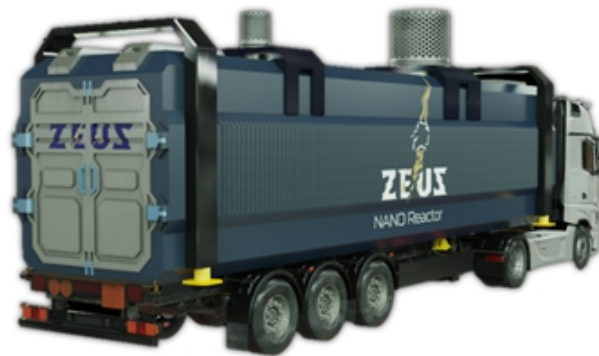
Renderings of proposed "Zeus" Microreactor